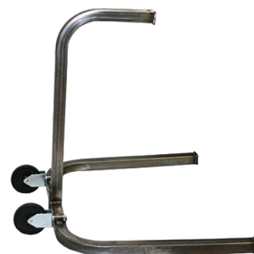
PS Portable Stroller 92 lbs (w/ fan)