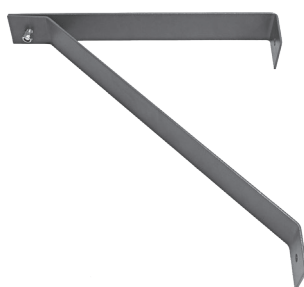
CW Column-Wall 69 lbs (w/ fan)