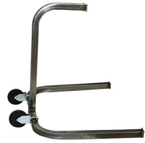
PS Portable Stroller 105 lbs (w/ fan)