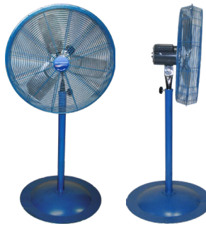
PB Pedestal Base Adjustable height: 42-72" 33" closed base