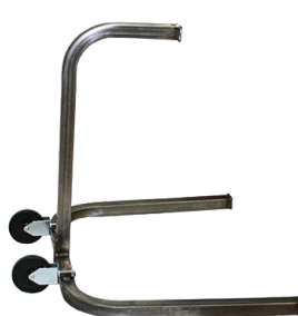
PS Portable Stroller 92 lbs (w/ fan)