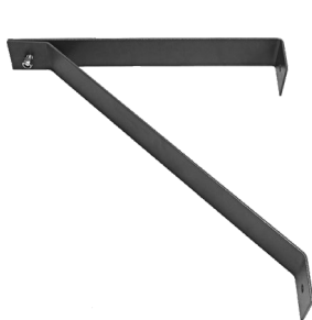
CW Column-Wall 69 lbs (w/ fan)