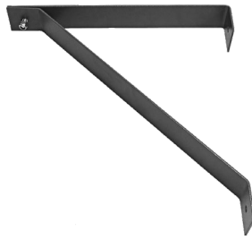
CW Column-Wall 82 lbs (w/ fan)