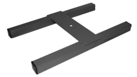
PB Pedestal Base 81 lbs (w/ fan)