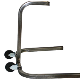
PS Portable Stroller 105 lbs (w/ fan)