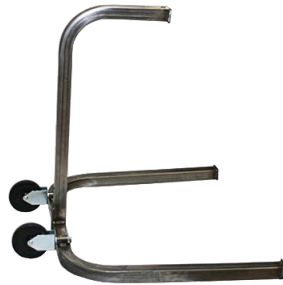
PS - Pedestal Stroller