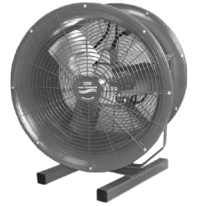
PB - Pedestal Base