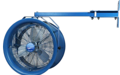
TC Truck Cooler