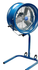
PS Portable Stroller