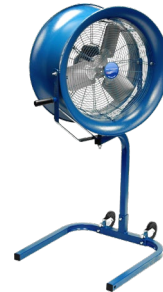
PS Portable Stroller