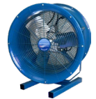
PB Pedestal Base