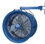
RM Rack Mount