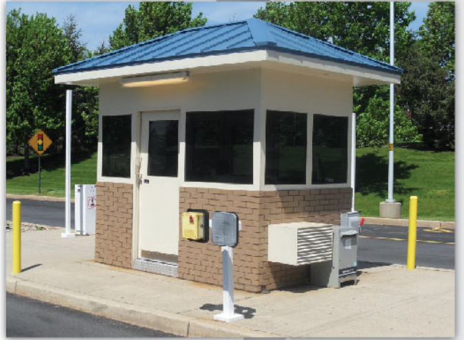
Model BR106 Durasteel with UL 752 Level 3 bullet resistant construction, sliding door, tinted glazing, factory adhered brick finish, thru wall HVAC, exterior lighting and standing seam hip roof with extended overhang