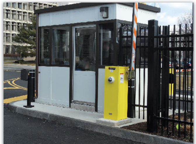
Model BR12076 Duraluminum with UL 752 Level 3 bullet resistant construction, sliding doors, tinted glazing, exterior lighting and custom painted exterior finish