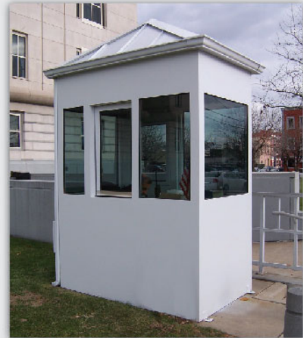
Model BR64 Durasteel UL 752 Level 3 bullet resistant construction, sliding door, sliding window, tinted glazing, thru wall HVAC and standing seam hip