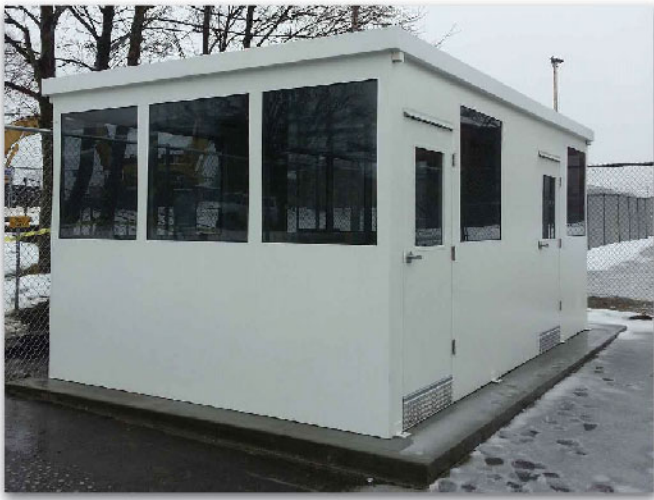
Model BR2012 Durasteel UL 752 with Level 4 bullet resistant construction, tinted glazing and swing doors