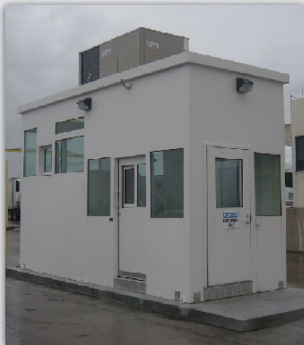
Model BR187 bi-level Durasteel with UL 752 Level 3 bullet resistant construction, swing door, sliding doors, sliding window, exterior lighting and commercial roof mounted HVAC unit