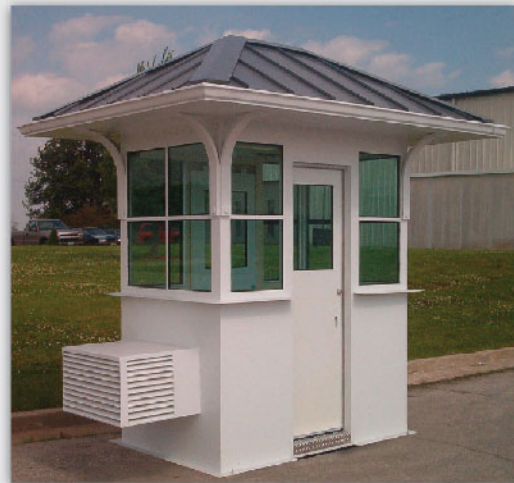
Model BR64 Durasteel with UL 752 Level 3 bullet resistant construction, sliding doors, thru wall HVAC, painted steel window mullions, ready-for-brick cap, standing seam hip roof with extended overhang and decorative rolled steel bars