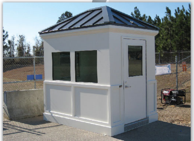
Model BR86 Durasteel with UL 752 Level 7 bullet resistant construction, swing door, tinted glazing, "colonial style" exterior wall finish and standing seam hip roof