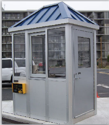
Model BR7648 Duraluminum with UL 752 Level 1 bullet resistant construction, swing door, sliding window and standing seam hip roof