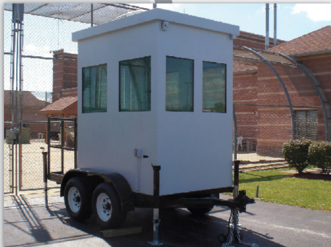
Model TRL-BR75 Durasteel with UL 752 Level 8 bullet resistant construction, trailer mounted and roof mounted AC unit

The images below and on the following pages you will find application photos that illustrate a few of the many different sizes and styles of ballistic prefabricated buildings we have manufactured. We also encourage you to visit our website to see even more!