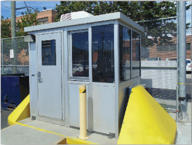
Model BR9676 Duraluminum with UL 752 Level 3 bullet resistant construction, swing door, tinted glazing, sliding window, exterior lighting and roof mounted AC