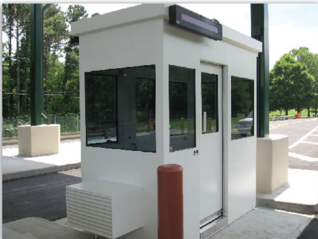
Model BR84 Durasteel with UL 752 Level 3 bullet resistant construction, sliding doors, thru wall HVAC and tinted glazing