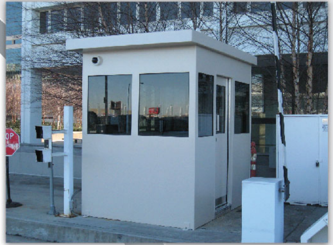
Model BR86 Durasteel with NJ III bullet resistant construction sliding door and tinted glazing