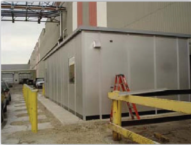
Model 480192 Duraluminum with clear anodized aluminum finish and wall mounted package HVAC unit