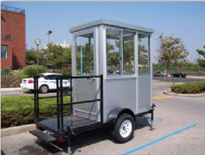
Model TRL-7648 trailer mounted Duraluminum with clear anodized aluminum finish