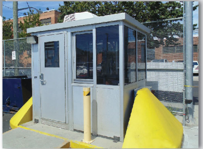
Model BR9676 Duraluminum with UL 752 Level 3 bullet resistant construction, swing door, tinted glazing, sliding window, exterior lighting and roof mounted AC