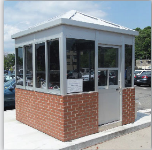
Model 9696 Duraluminum with standing seam hip roof, tinted glazing, factory adhered brick and clear anodized aluminum finish