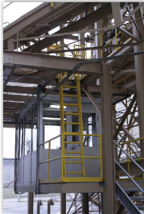
Model 14476 Duraluminum with clear anodized aluminum finish