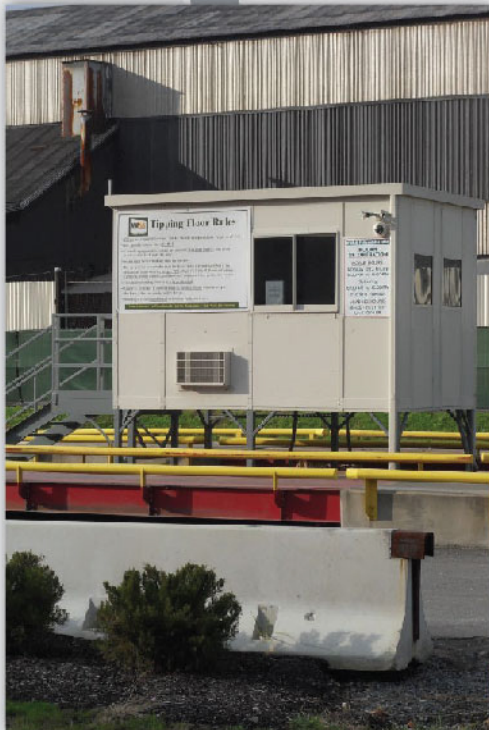
Model 14496 Duraluminum with total exterior paint finish, tinted glazing, elevated legs, stair and landing

These application photos illustrate just a few of the many different sizes of Duraluminum buildings we have manufactured along with a sampling of the optional design features we can include to enhance the appearance of these buildings. We also encourage you to visit our website to see even more!