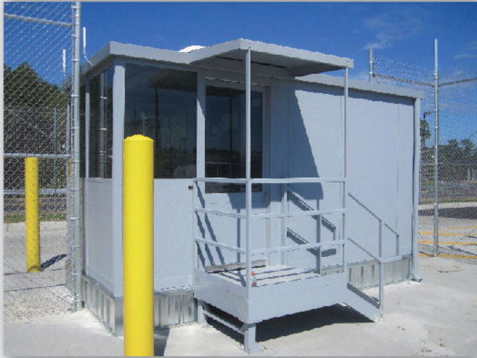
Model 18388 Duraluminum with total exterior paint finish, tinted glazing, factory plumbed integral restroom, canopy over door, raised platform, stair and landing