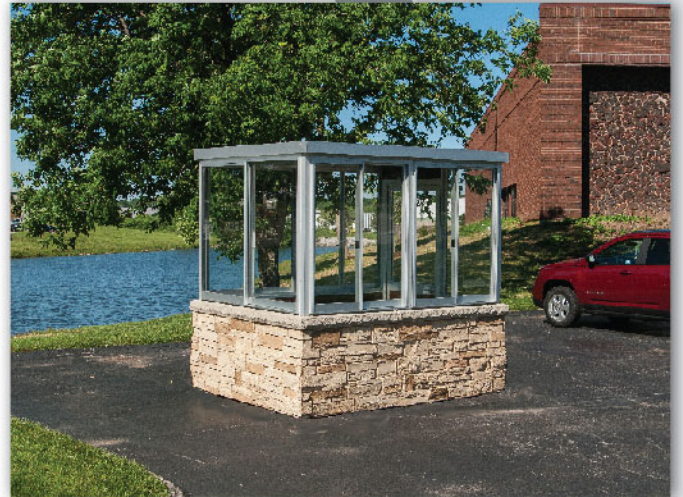
Model 9676 Duraluminum with faux stone finish