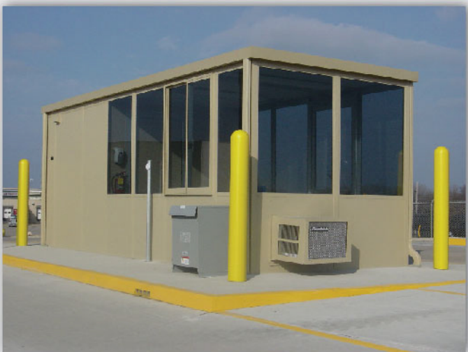
Model 24096 Duraluminum with total exterior paint finish, tinted glazing and integral restroom