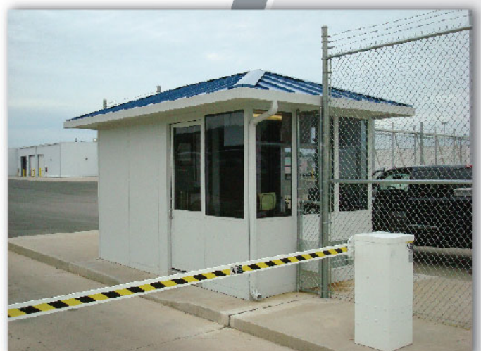
Model 16896 Duraluminum with standing seam hip roof, total exterior paint finish, tinted glazing and integral restroom