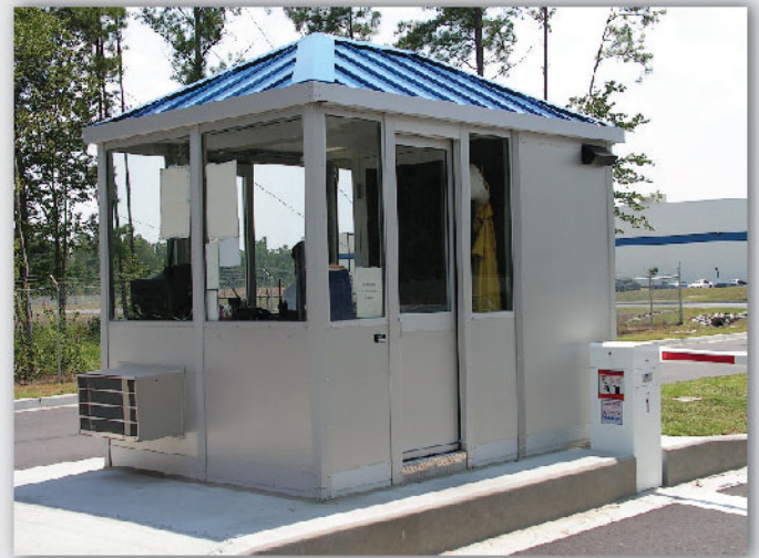
Model 12084 Duraluminum with standing seam hip roof, clear anodized aluminum finish and integral restroom