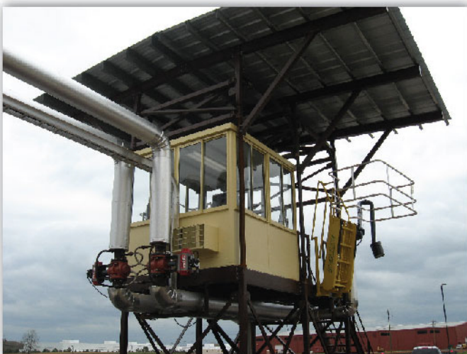
Model 9696 Duraluminum with total exterior paint finish