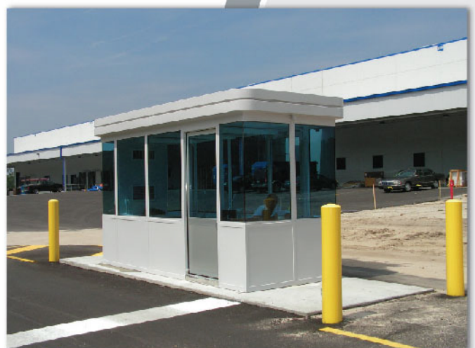
Model PC-156 Durasteel with radius fascia and reveal, tinted glazing and butt-to-butt glazed corners