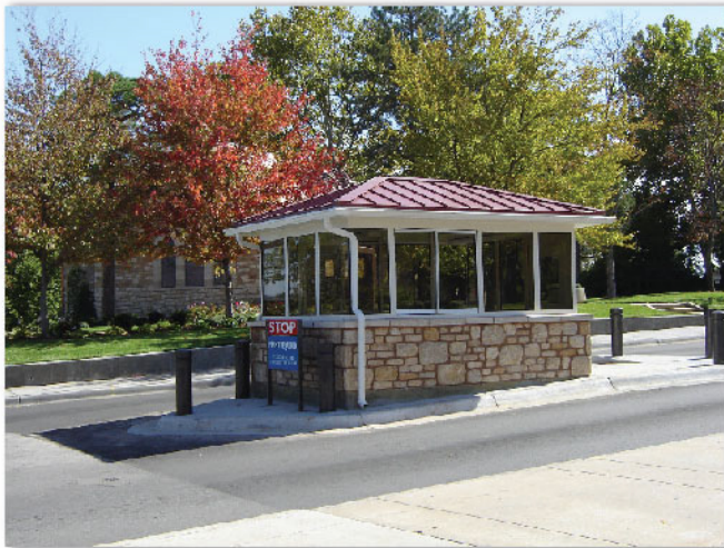
Model 139 Durasteel with extended overhang standing seam hip roof, tinted glazing and site installed stone finish