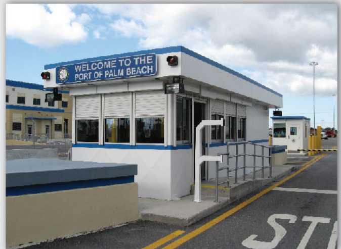
Model 3010 Durasteel with extended roof overhang and fascia, tinted glazing, custom lower steel wall panels, two-tone paint finish, integral restroom, exterior lighting and hurricane shutters