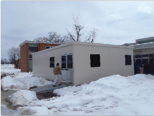
Model 3525 Durasteel with tinted glazing and two-piece construction with bolt together connections