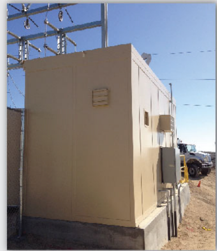
Model PC-198 Durasteel with wall louvers and interior explosion proof electrical components