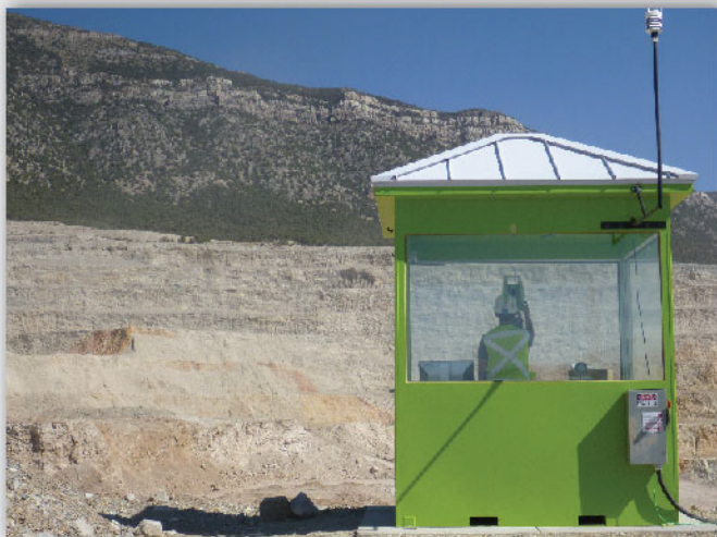
Model 76 Durasteel with standing seam hip roof and fork pockets in the base