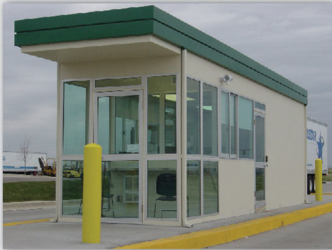
Model PC-317 Durasteel with extended roof overhang and fascia with reveal, integral restroom and full glass vestibule in front