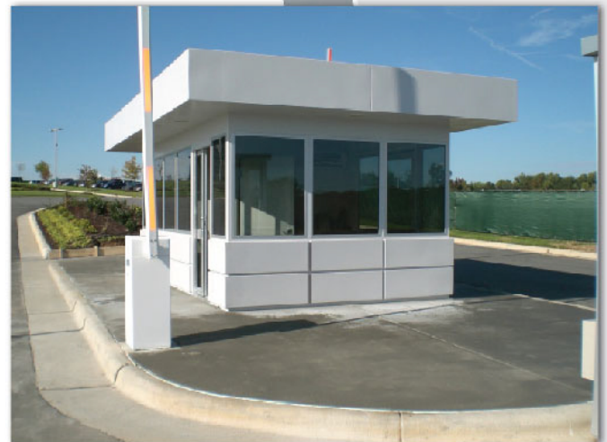
Model 1810 Durasteel with horizontal wall reveals, tinted glazing, extended roof overhang and fascia