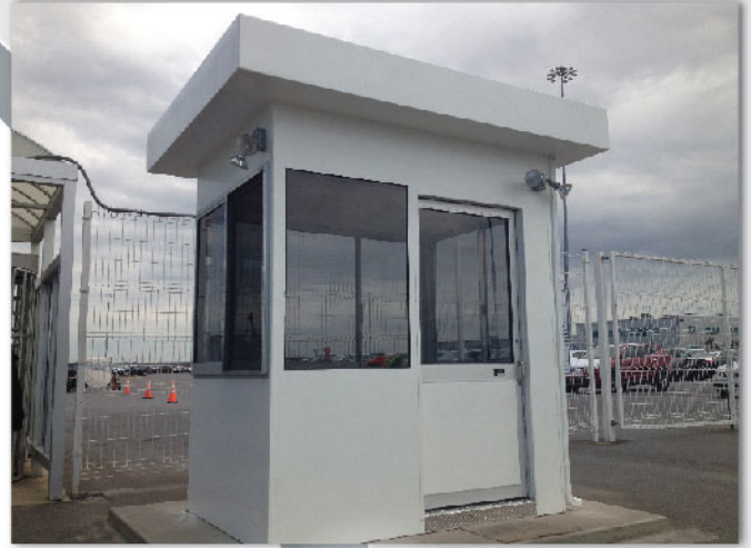
Model 75 Durasteel with exterior lighting, tinted glazing, extended roof overhang and fascia