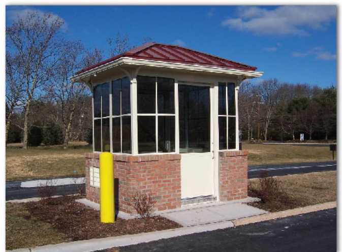
Model 86 Durasteel with extended overhang standing seam hip roof, tinted glazing, colonial style window mullions and site installed brick finish