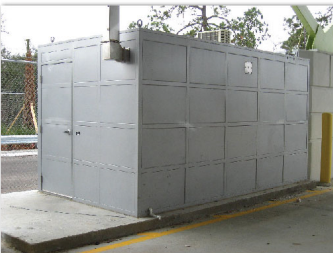
Model PC-158 Durasteel with custom wall panels and door