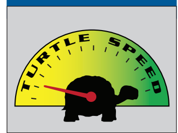
Turtle speed setting reduces drive speed by 50% for precise positioning or when working in tight quarters