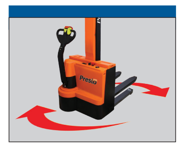
Tight turning radius allows PowerStak to work in much narrower aisles than conventional forklift trucks.