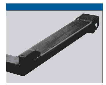
Solid steel straddle legs provide rigidity and eliminate deflection even under maximum load conditions.