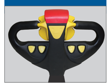
Ergonomic handle with comfort-grip controls and switch redundancy for left- or right-hand operation.