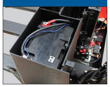
Sealed, maintenance-free AGM batteries and heavy-duty built in charger with fuse protection.