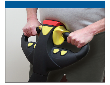
Auto-reversing "belly bump" switch protects against operator accidents while working in tight quarters.