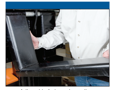
Adjustable fork carriage allows forks to be repositioned to best accommodate loads (straddle only).