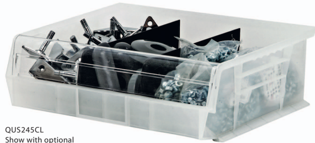
QUS245CL Show with optional Divider and Window