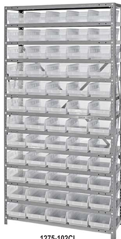
1275-102CL 12"D x 36"L x 75"H