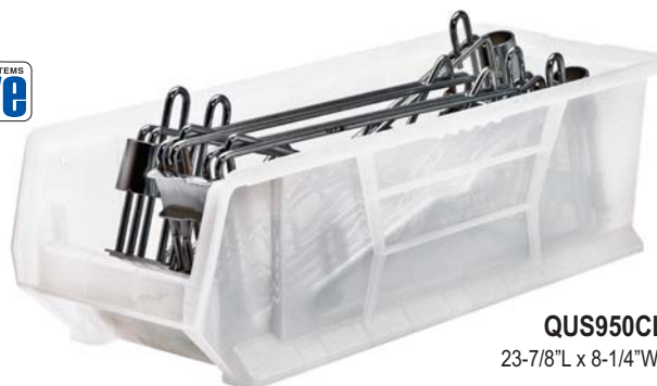
QUS950CL 23-7/8"L x 8-1/4"W x 7"H