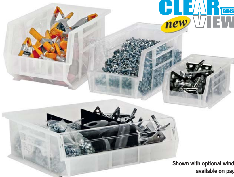
Shown with optional window & dividers, available on page 13

Organize your inventory with strong injection molded tri-clear polypropylene bins. Front, back and side grips for easy handling. Built in rear hanger allows bins to hang from louvered panels or rails. Optional clear injection molded crystal styrene window increases bin capacity and provides quick view of bin contents. Dividers maximize flexibility and keep contents organized. Wide stacking ledge and anti-slide lock keep stacked bins steady and prevent forward shifting. Waterproof bins resist rust and corrosion. Large molded front label slots for ID labels. Autoclavable up to 250°F and resistant to extreme cold. Color: Clear.