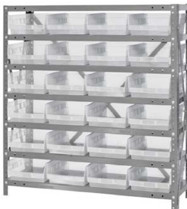
1239-107CL 12"D x 36"W x 39"H