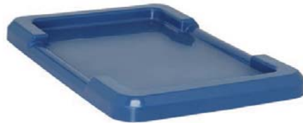
LID2516-8 Optional lid keeps stored items dust free. Tubs can still stack or cross stack with lids in place.