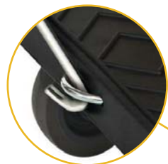
ATTACHED PULL RING allows dolly to be pulled with ease