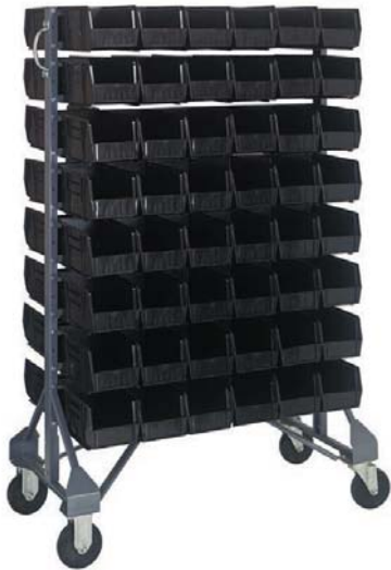
QRU-16DCO + QRU-MOBSCO Shown with 96 QUS230CO (Bins sold separately)