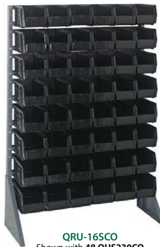
QRU-16SCO Shown with 48 QUS230CO (Bins sold separately)