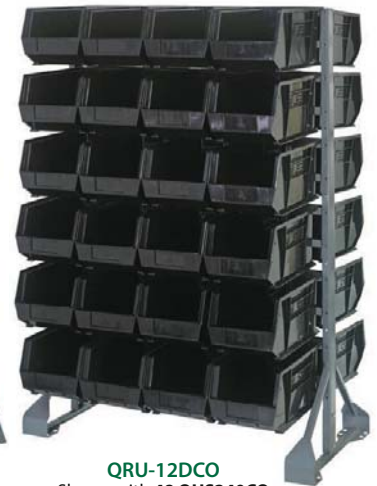
QRU-12DCO Shown with 48 QUS240CO (Bins sold separately)