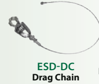
ESD-DC Drag Chain

CONVERT STANDARD WIRE SHELVING INTO CONDUCTIVE SHELVING WITH THESE ACCESSORIES THAT ARE INCLUDED WITH THESE PACKAGES