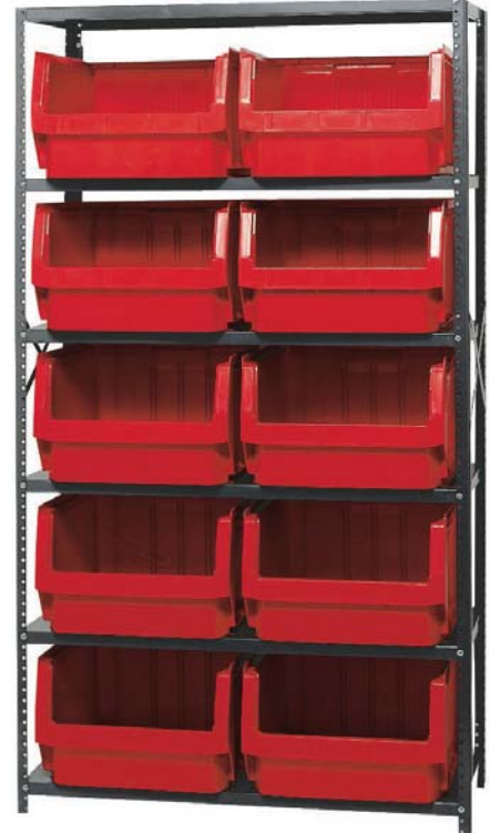
MSU-543 6 shelves and 10 QMS543 19-3/4"L x 18-3/8"W x 11-7/8"H bins