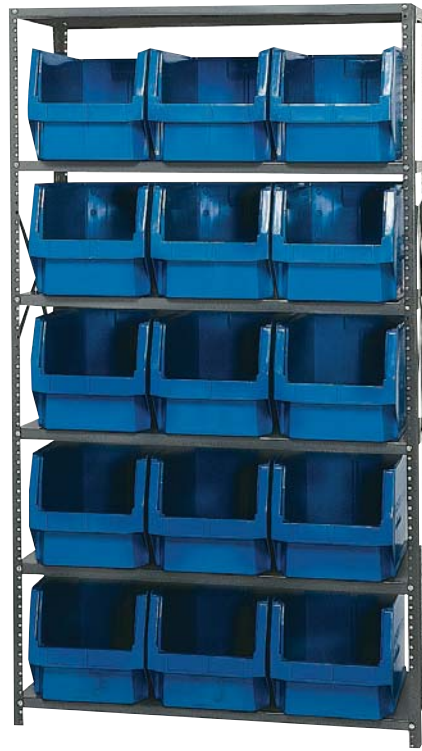
MSU-533 6 shelves and 15 QMS533 19-3/4"L x 12-3/8"W x 11-7/8"H bins