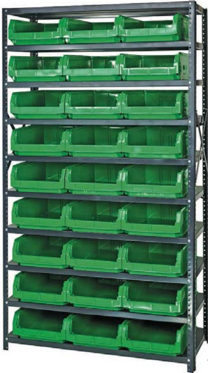
MSU-531 10 shelves and 27 QMS531 19-3/4"L x 12-3/8"W x 5-7/8"H bins