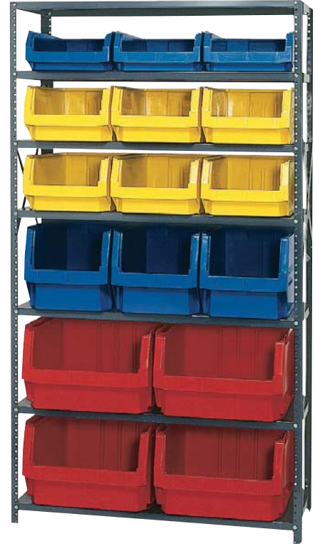
MSU-16-MIX 7 shelves and 4 QMS543 19-3/4"L x 18-3/8"W x 11-7/8"H bins, 3 QMS533 19-3/4"L x 12-3/8"W x 11-7/8"H bins, 6 QMS532 19-3/4"L x 12-3/8"W x 7-7/8"H bins, 3 QMS531 19-3/4"L x 12-3/8"W x 5-7/8"H bins