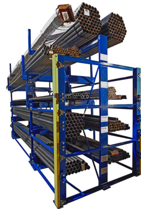
Crank-Out Cantilever Loaded