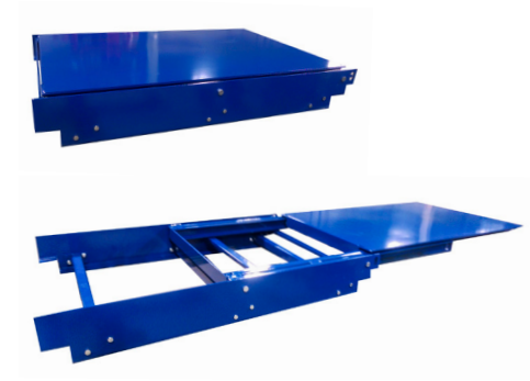
Shelf Mounted Glide-Out Shelving