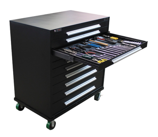
Custom Tool Cabinet