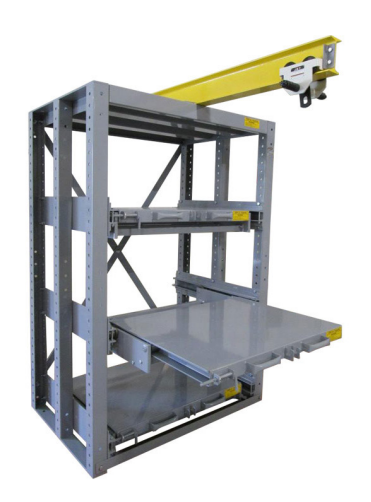
Glide-Out with Monorail Crane

Custom powder colors Enclosed sides, back, & doors Rear load shelves Safety Interlock system