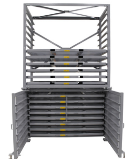
Multipurpose Combo Unit