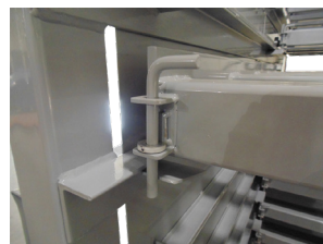
Automatically Locks Open Shelves in Place