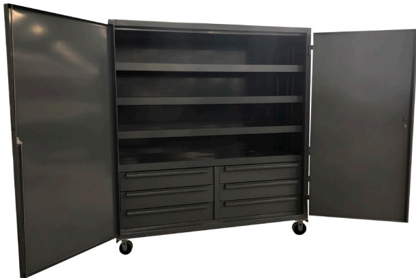
Spare Parts Cabinet Opened Front View