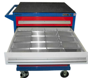
Push Bar with Swivel Casters