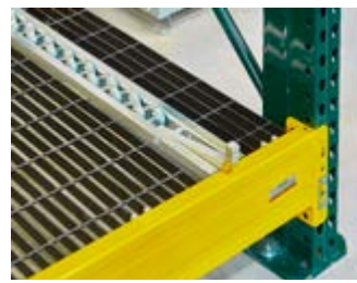
Grating for fall protection or as a walking surface