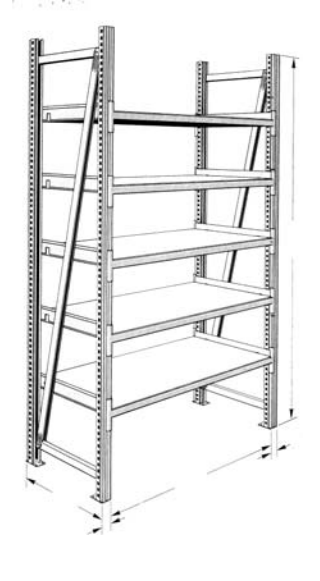
Type S (Tilted)