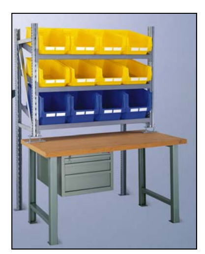
Cantilevered Leg Shown with Workbench (Workbench Must Be Ordered Separately)