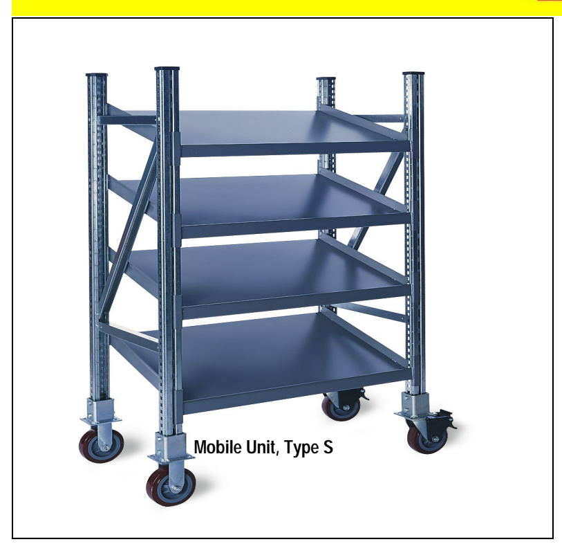
Other Configurations Are Available. Contact Project Services