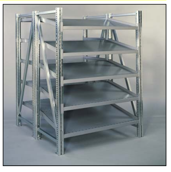
Type GH Double-Depth Bay with a Combination of Straight and Tilted Shelves