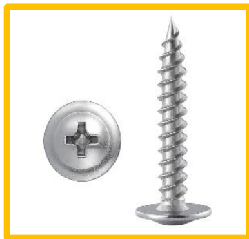
Tekscrew (8 x 1)

(2) The Beam Pallet Stop comes with 2 options for hardware. With the Tex Screw through the top holes on the legs of the Beam Pallet Stop. Tighten until Beam Pallet Stop is snug and securely in place. For The Bolt Through Option Slide bolt through the bottom holes and secure with nut