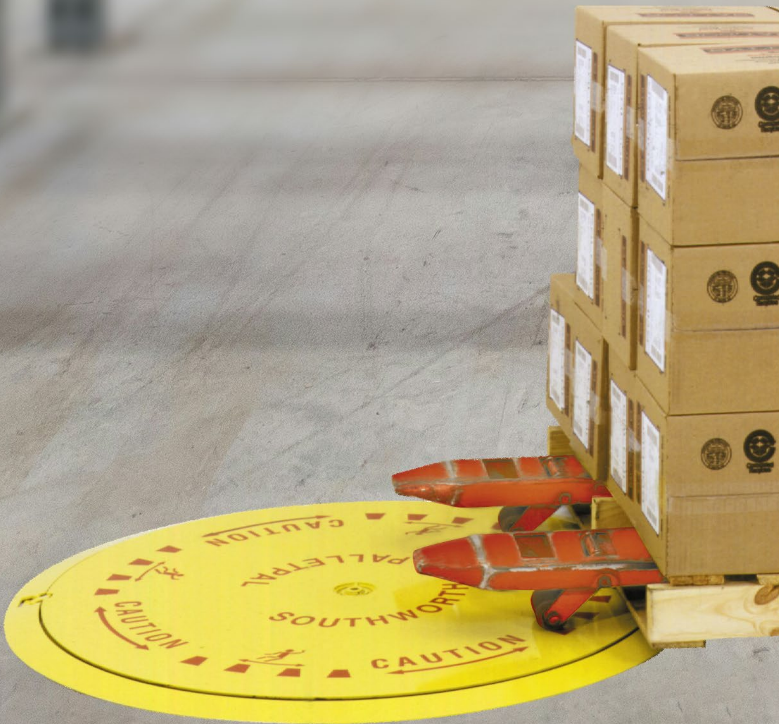
PalletPal Disc Turntable application