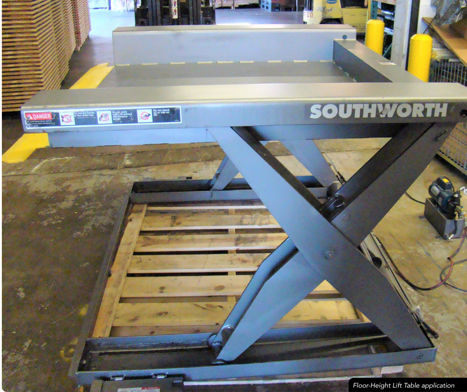
Floor-Height Lift Table application