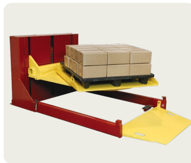
Model Roll-C with Turntable