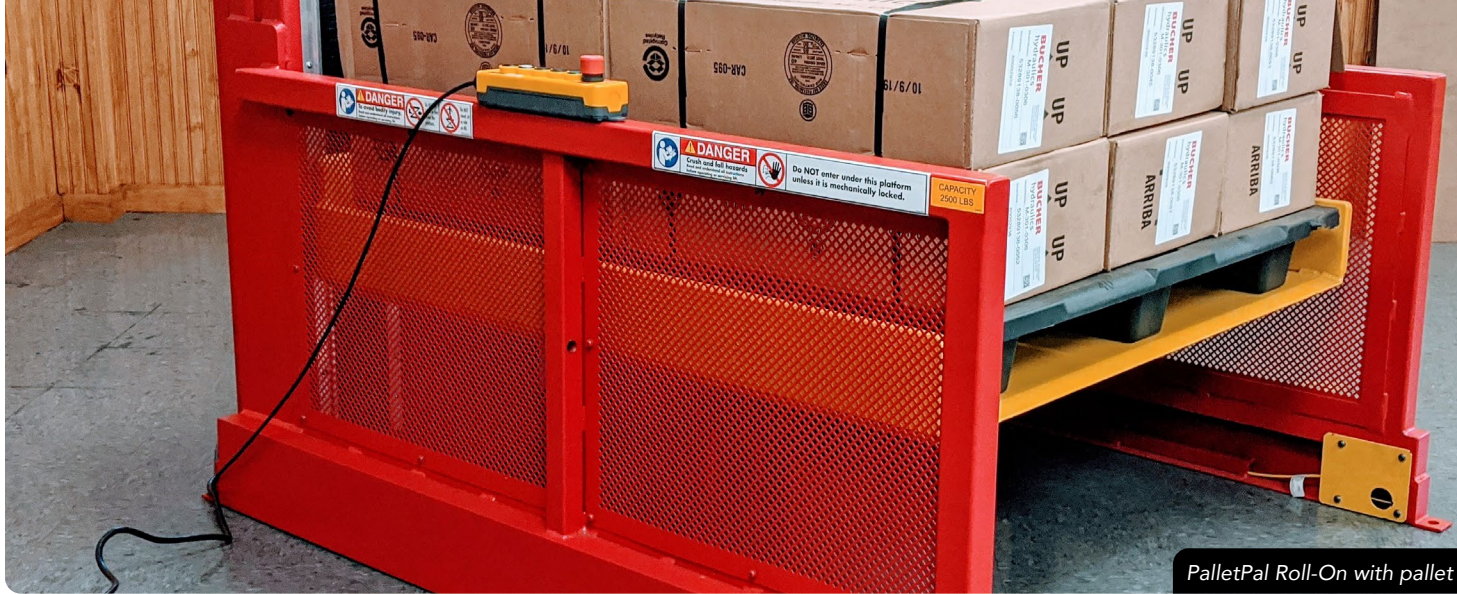
PalletPal Roll-On with pallet