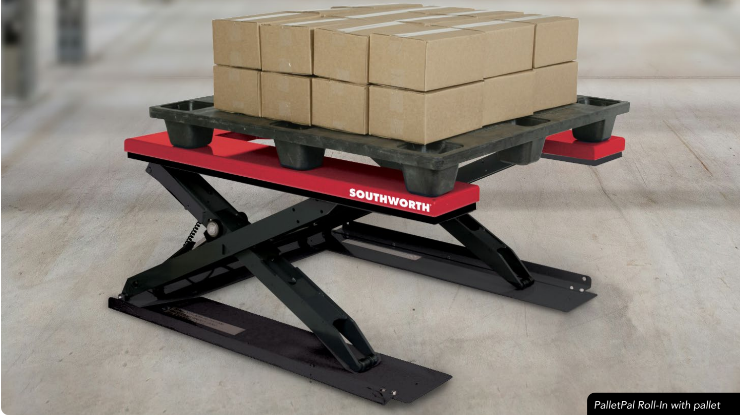
PalletPal Roll-In with pallet