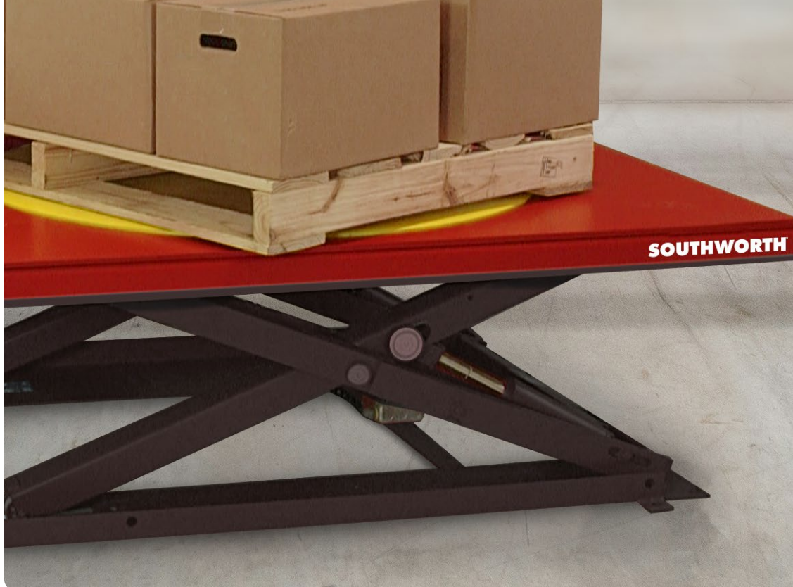
LiftMat Lift Table with Turntable