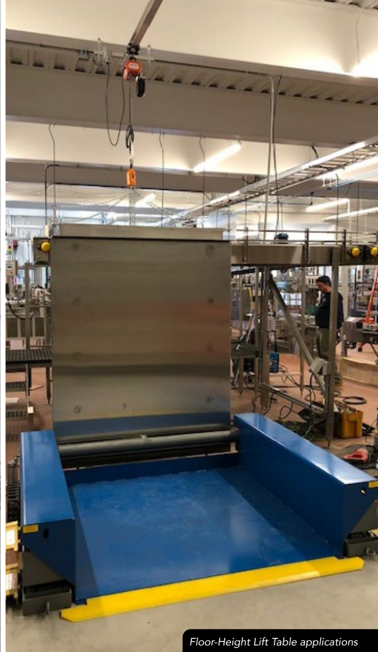
Floor-Height Lift Table applications