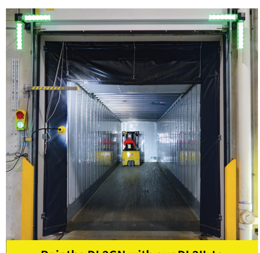
Pair the DL2GN with our DL2IL to maximize safety and productivity!