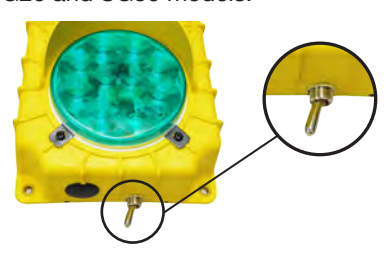
Toggle switch available on SG20 and SG30 models.