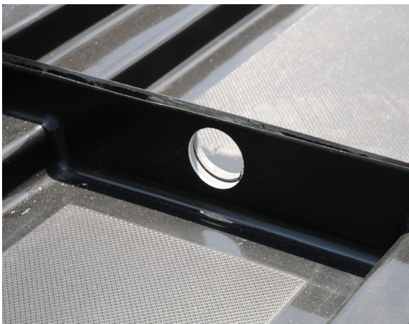
Optional flow through technology increases containment capacity for larger spills while minimizing cleanup of smaller spills.