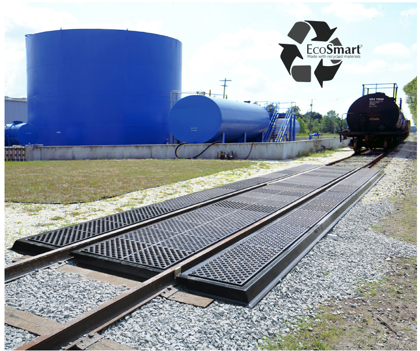
System shown includes one Center Pan (Part# 7200) and two Side Pans (Part# 7210)