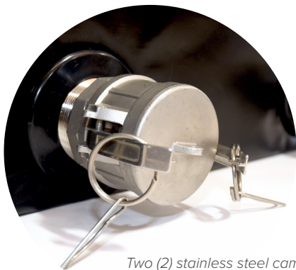
Two (2) stainless steel camlock fittings allow quick and leak-free drainage of spilled chemicals.