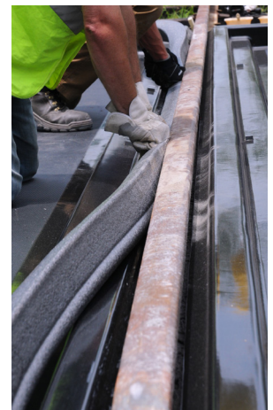
Optional rail side gaskets prevent leaking between rails and Track Pans.

Visit www.trackpans.com for more detailed information.