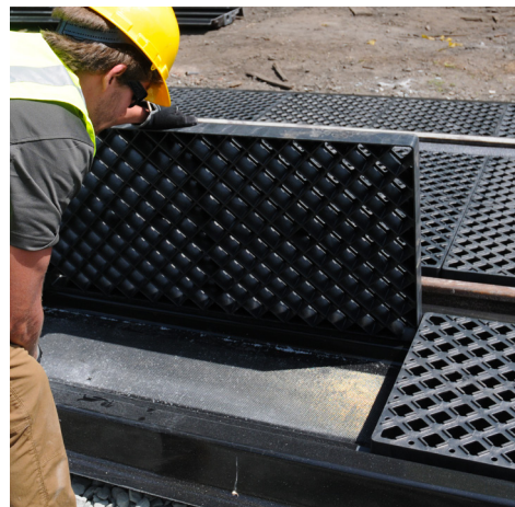
Optional polyethylene grating package available for safer foot traffic.