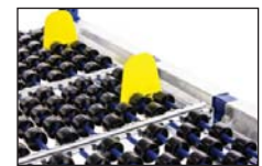
Optional Infeed Guides for use with Span-Track Bed

If lane, what width track? 6" 9" 12" 15"