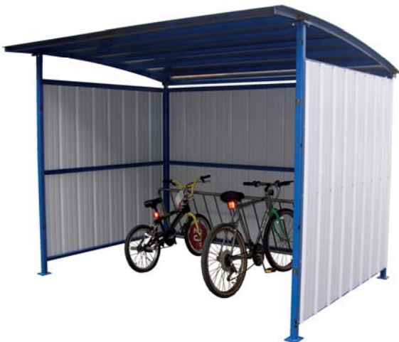
MDS-96-BK Completed Assembly

The Bike Rail simply slides over the Bike Bracket posts and is secured on the left side by the 5/32" X 1-1/2" Cotter Pin.