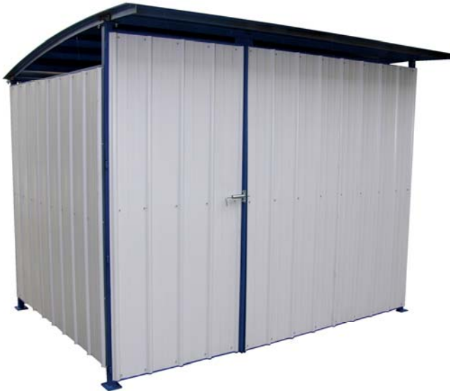
MDS-96-DR Completed Assembly

Install Floor Lock Pin on the inside of the Large Door. May need to bore hole into the floor depending on the mounting surface.