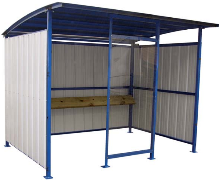
MDS-96-SM Completed Assembly