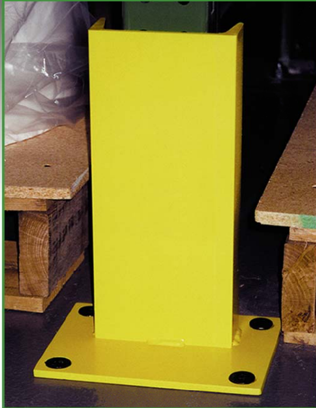
Shown with Optional Flush Mounted Anchors