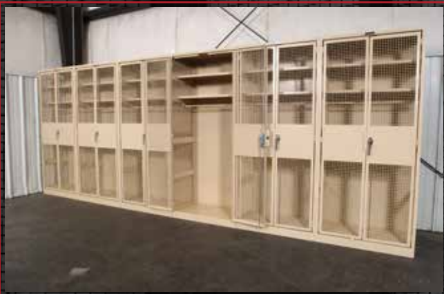
TACTICAL GEAR STORAGE