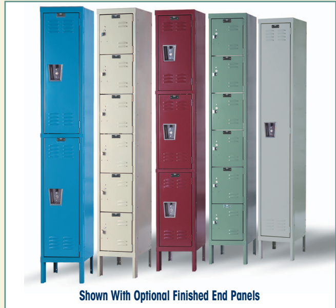
Shown With Optional Finished End Panels